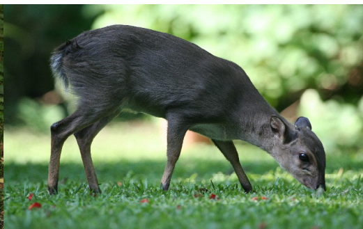
Female blue duiker

Plat 1: blue duiker ( Philantomba monticola )