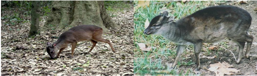
Male Maxwell's duiker