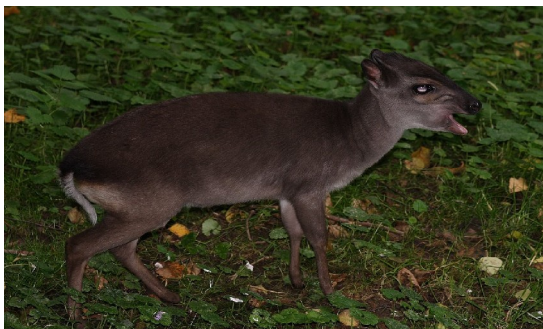
Male blue duiker

Each transect was walked three (3) times, 'to and fro' for diurnal and nocturnal surveys. The diurnal surveys was conducted between 6:00 and 9:00 hours while the nocturnal survey was carried out between 19:00 and 22:00 hours using flash light for proper identification. For both surveys, sighting and perpendicular distances were measured for all species' of duikers encountered. In addition, each of the duikers sighted was identified to species level. The time of sighting, numbers of the individuals seen along the transect lines were noted. The developmental stages of the animals sighted (adult or juvenile) and sex (male or female, Plates 1 and 2) were also recorded in the course of the transect walks. In total, all transects were walked 144 times (i.e. 3×2×2×12), which resulted in 288 km survey efforts (i.e. 144 × transect length, which is 2 km).